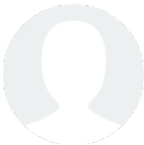
Kevin Ruesch Realty