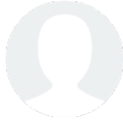
Tyson Adashun Jones, Inc.