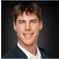
Ayden Adashun Jones, Inc.