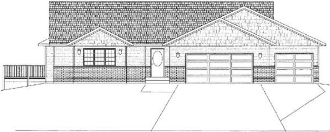
6087 N. LEWELLEN ST. MARSHALL, WI

6087 LEWELLEN Street, Marshall, WI, 53559