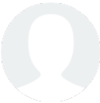
Shawn Evermore Realty