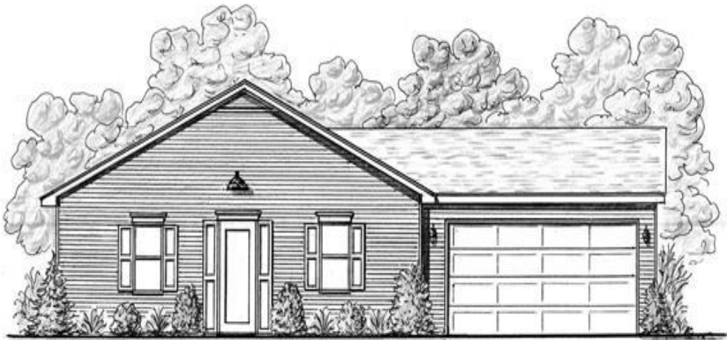
RACEHORSE SHUTTER ELEVATION

606 Delavan W Drive, Janesville, WI, 53546