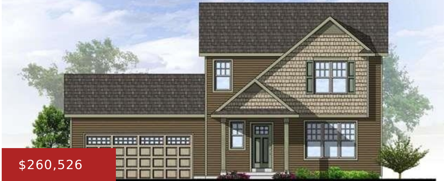
REPRESENTATIVE MODEL FOR COMPARISON

6032 BIG DIPPER Drive, Madison, WI, 53718