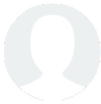
Steve First Weber, Realtors, Oshkosh