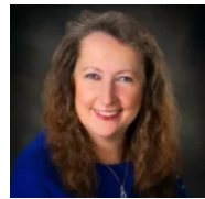
Bonnie Adashun Jones, Inc.