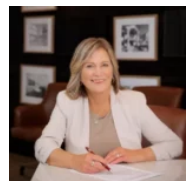
Jan Adashun Jones, Inc.