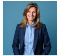
Gail Adashun Jones, Inc.