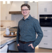
Glenn Adashun Jones, Inc.