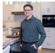
Glenn Adashun Jones, Inc.