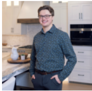
Glenn Adashun Jones, Inc.