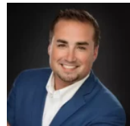
Kevin Adashun Jones, Inc.