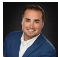
Kevin Adashun Jones, Inc.