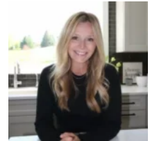
Kelly Adashun Jones, Inc.