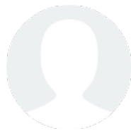
Judd Dallaire Realty