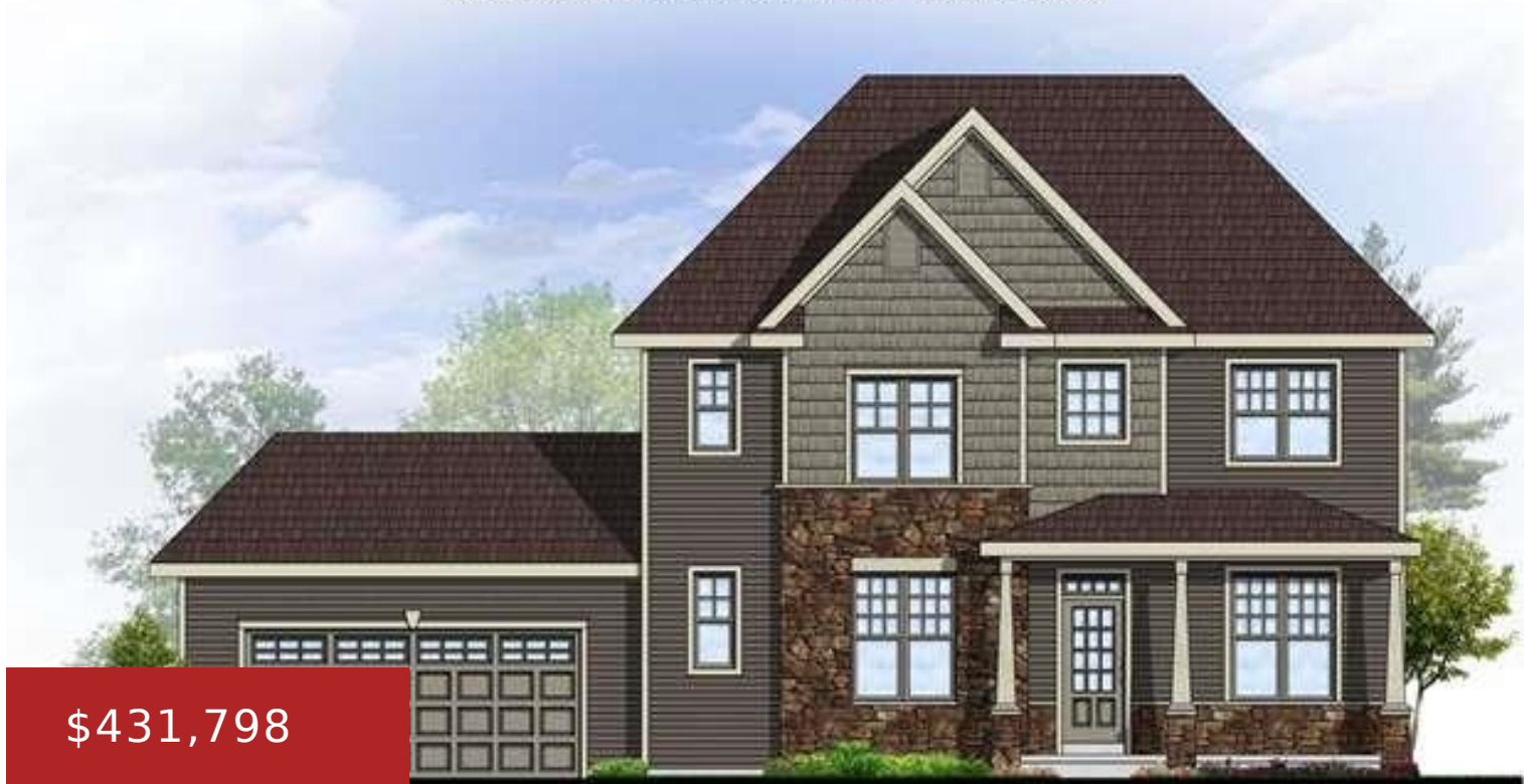
REPRESENTATIVE MODEL FOR COMPARISON

553 Whispering Pines Way, Verona, WI, 53593