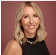
Christine Adashun Jones, Inc.