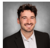
Ben Adashun Jones, Inc.