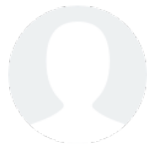
Jason Zellner Real Estate