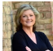
Vicki Adashun Jones, Inc.