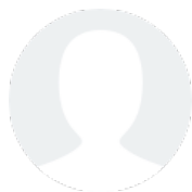
Greg Dallaire Realty