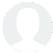
Deborah Meacham Realty, Inc.