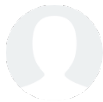
Josh Acre Realty, Ltd.