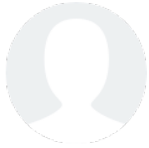
Mike Acre Realty, Ltd.