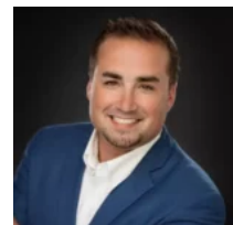
Kevin Adashun Jones, Inc.