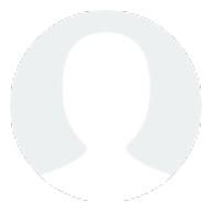
Darren Coaction Real Estate, LLC