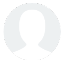
Jason Zellner Real Estate