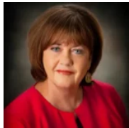
Vickie Adashun Jones, Inc.