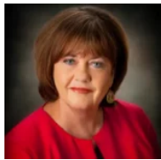
Vickie Adashun Jones, Inc.