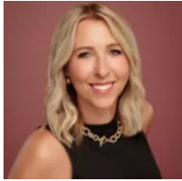
Christine Adashun Jones, Inc.