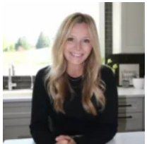
Kelly Adashun Jones, Inc.