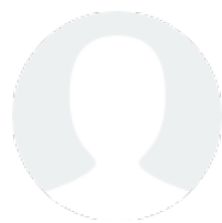
Jesse Hartfiel Realty