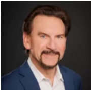
Frank Adashun Jones, Inc.

Cozy 1 story home with 2 bedrooms, 1 bath,deck leading out to yard.