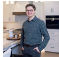
Glenn Adashun Jones, Inc.