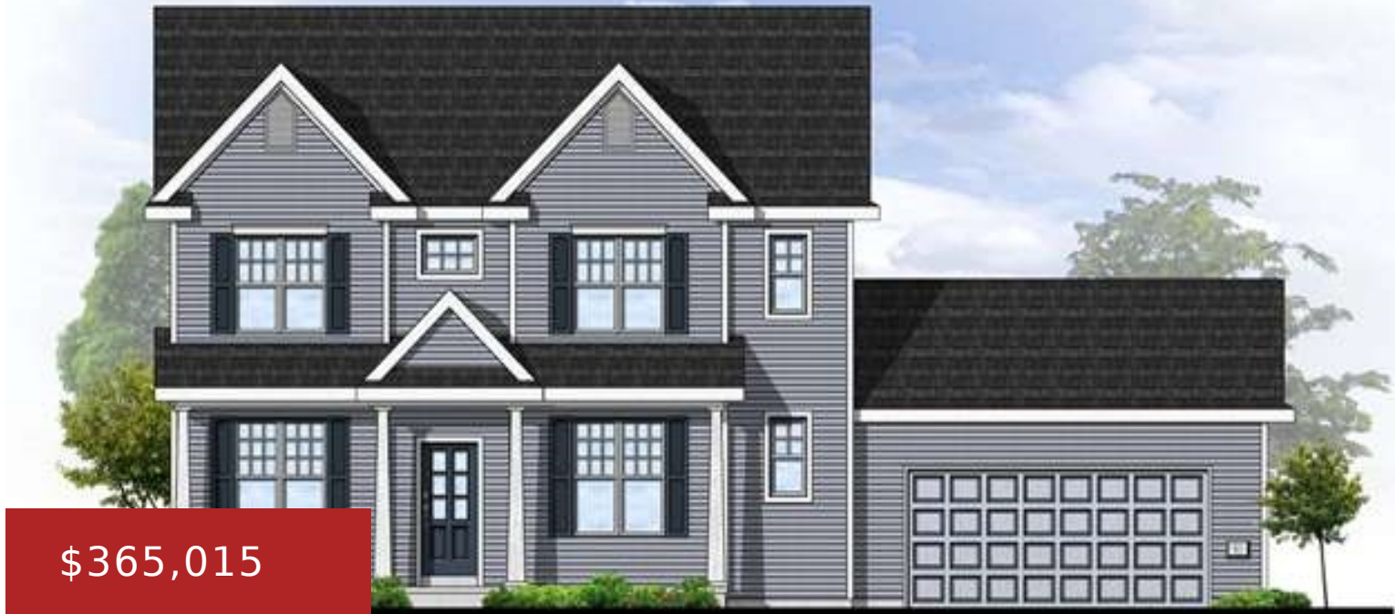
REPRESENTATIVE MODEL FOR COMPARISON