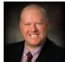
Chris Adashun Jones, Inc.