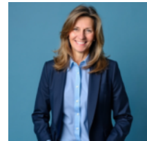
Gail Adashun Jones, Inc.