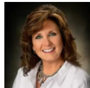
Debra Adashun Jones, Inc.