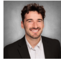
Ben Adashun Jones, Inc.