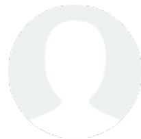
Kyle Real Broker LLC