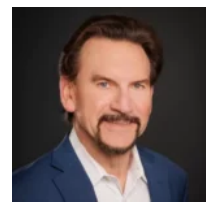
Frank Adashun Jones, Inc.