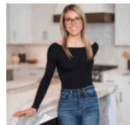
Jada Adashun Jones, Inc.