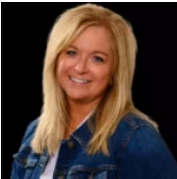
Colette Adashun Jones, Inc.