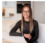
Jodi Adashun Jones, Inc.

Come check out this newly remodeled 3 bedroom, 1.5 bath home with a cozy living room including an electric fireplace. This home is in a great area and ready for you to make it yours!