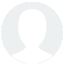
Vicky Beckman Properties