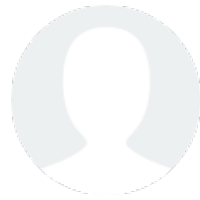
Amy Roberts Homes and Real Estate