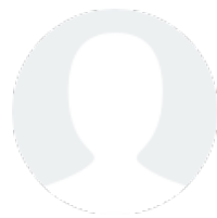
Brooke Roberts Homes and Real Estate