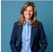
Gail Adashun Jones, Inc.