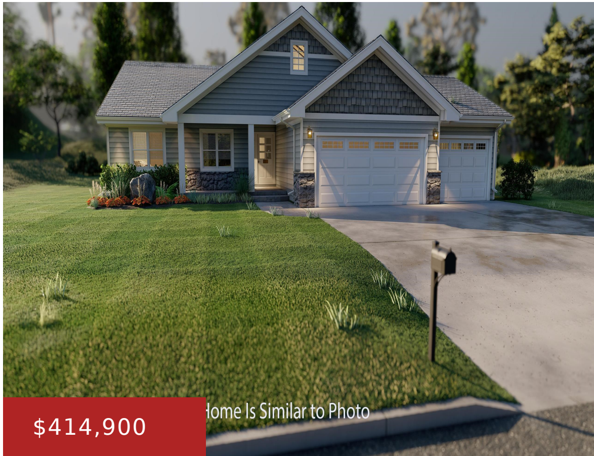
Home Is Similar to Photo

4674 PAUL Lane, GREEN BAY, WI, 54313-0000