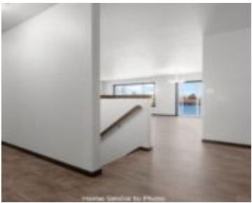
Home Similar to Photo