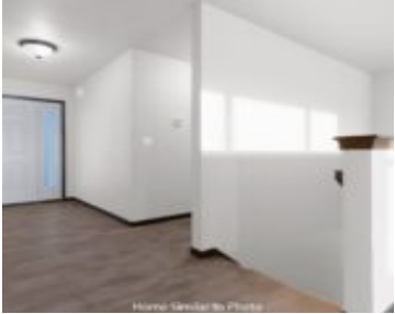
Home Similar to Photo