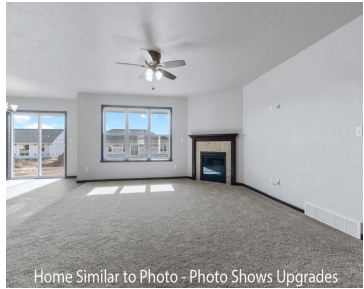
Home Similar to Photo - Photo Shows Upgrades