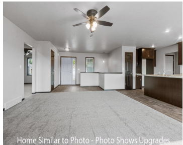
Home Similar to Photo - Photo Shows Upgrades