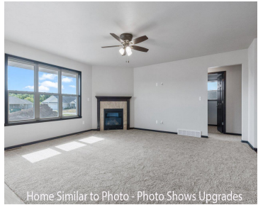
Home Similar to Photo - Photo Shows Upgrades